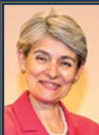
President Irina Bokova

The CCDS faculty is composed of professors, high profile politicians and experienced professionals from both the public and private sectors. Our faculty includes senior university professors, leading politicians and high-profile individuals from prestigious institutions.