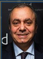
Dr. Hrant Bagratyan

Former Prime Minister of Armenia; Center for Cultural Diplomacy Studies (CCDS)