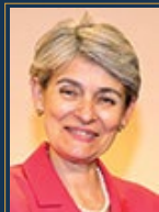
President Irina Bokova

The CCDS faculty is composed of professors, high profile politicians and experienced professionals from both the public and private sectors. Our faculty includes senior university professors, leading politicians and high-profile individuals from prestigious institutions.