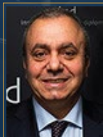
Dr. Hrant Bagratyan

Former Prime Minister of Armenia; Center for Cultural Diplomacy Studies (CCDS)